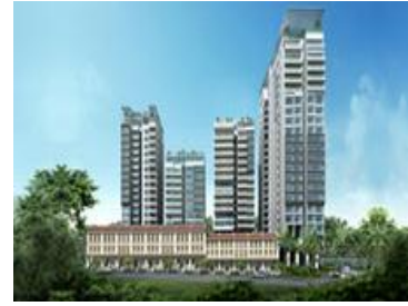
The Wharf Residences