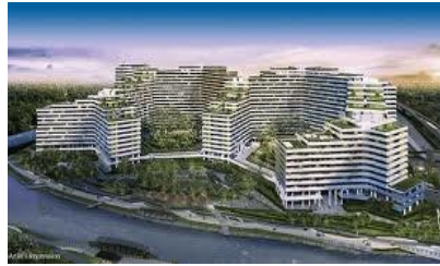
Waterway Terraces 1