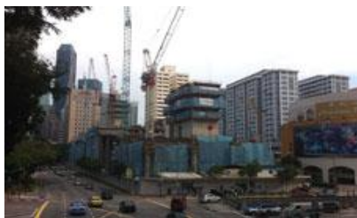
Park Royal at Upper Pickering Street