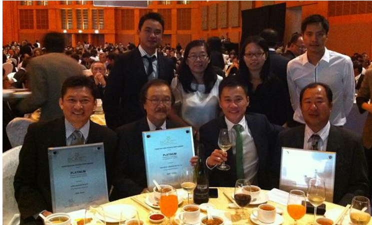
Tiong Seng representatives and partners at the Building and Construction Authority of Singapore (BCA) Awards

25 May 2012 – Once again, Tiong Seng is recognised for its construction excellence, construction productivity and safety efforts on local and international shores!