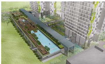
Kent Vale II Staff Housing Development